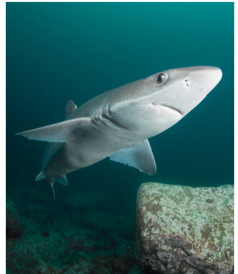
The status of the spiny dogfish fishery along the Atlantic Coast changed to "rebuilt" in 2010.

Each year since 1997, NOAA Fisheries reports to Congress the number of stocks and complexes that are and are not subject to overfishing, and those that are or are not overfished. These findings are based on determinations made throughout the reporting year and years prior. This annual report summarizes the best available science on our stocks to inform the management process to take appropriate action with the goal of ending overfishing and reaching sustainable populations of fish. All quarterly reports are posted online throughout the year, and annual reports are posted in their entirety at www.nmfs.noaa.gov .